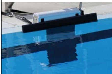
Backstroke starting device, article no. 1910054

Short strap = Fits malmsten starting blocks Long strap = Required for certain models