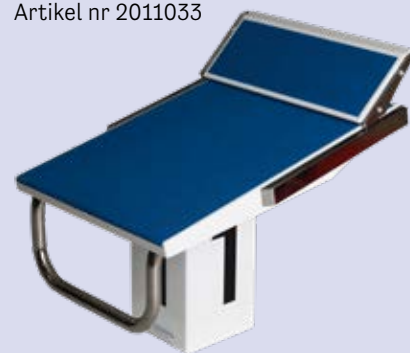
Starting block Malmsten Classic with Track Start