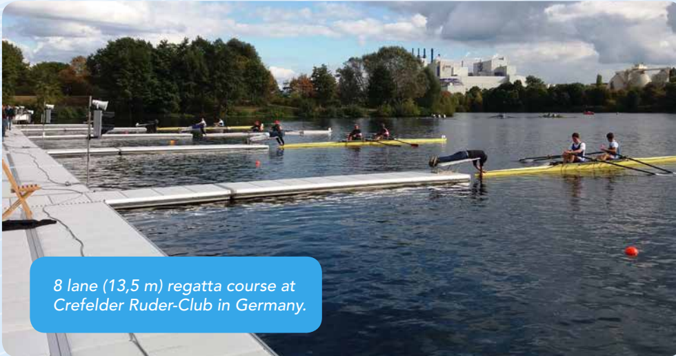
8 lane (13,5 m) regatta course at Crefelder Ruder-Club in Germany.

Please visit our website www.floattech.se for further details and to watch a short video