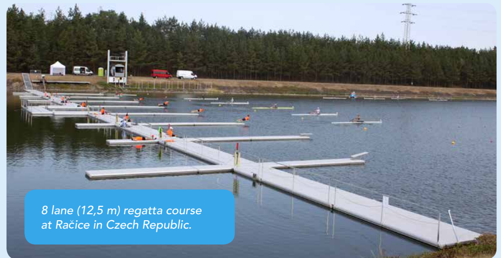
8 lane (12,5 m) regatta course at Račice in Czech Republic.