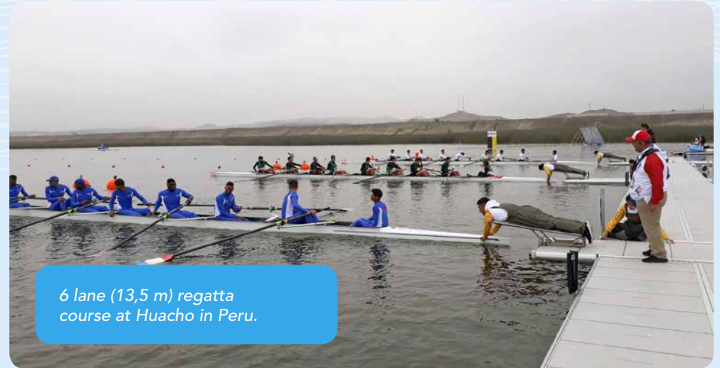
6 lane (13,5 m) regatta course at Huacho in Peru.