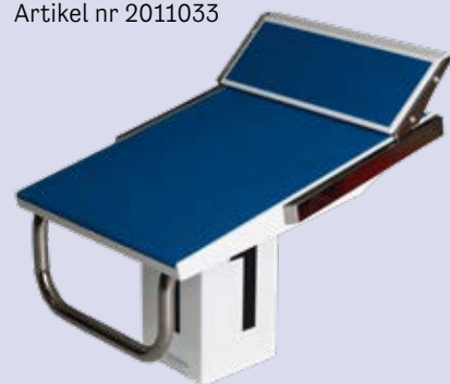
Starting block Malmsten Classic with Track Start