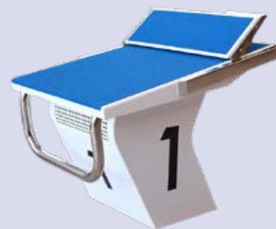
Starting block Malmsten PRO with Track Start